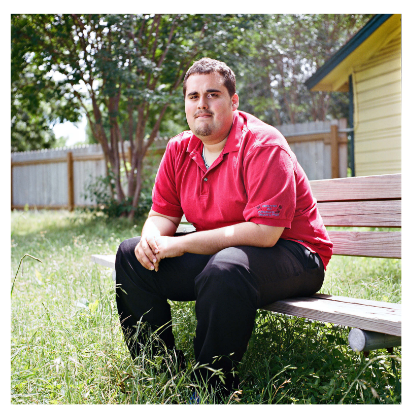
Damon, San Antonio

communities. THN also facilitated Youth Count Texas! participation from cities located in the BoS CoC for which it is the lead. The BoS CoC includes 215 mostly rural Texas counties.